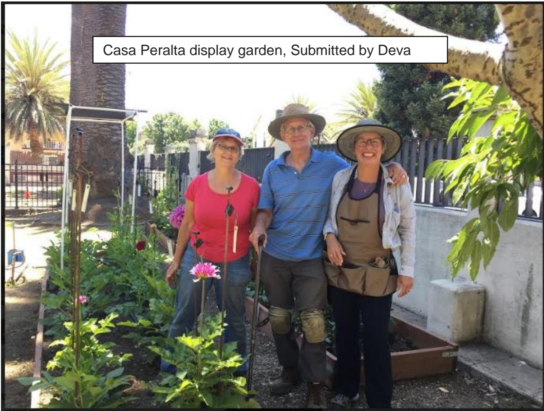
Casa Peralta display garden, Submitted by Deva