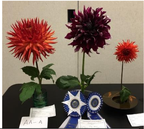
This magnificent bloom was best in show & best AA-A, was grown by Quamrun and is a new cultivar called My Hero.