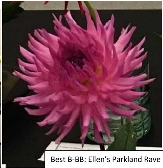
Best B-BB: Ellen's Parkland Rave