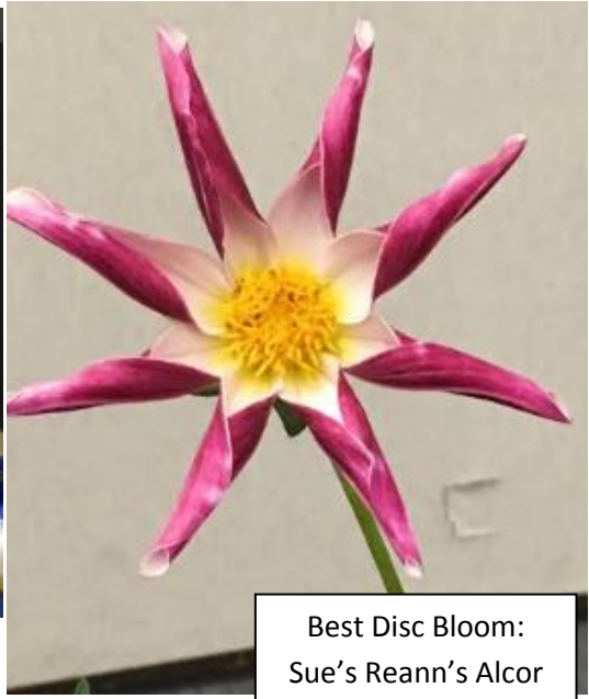
Best Disc Bloom: Sue's Reann's Alcor