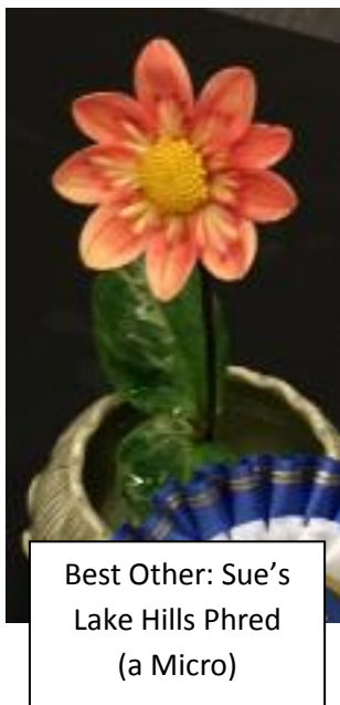
Best Other: Sue's Lake Hills Phred (a Micro)