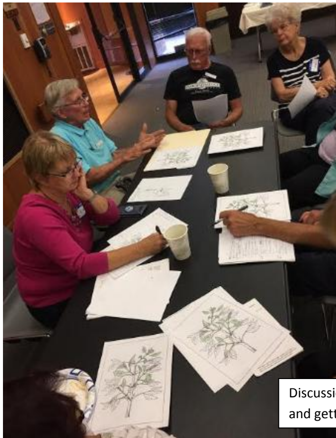
Discussion on disbudding for larger flowers and getting 2 leaves for a show