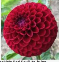
Jackie's Red Devil-te-lr.jpg