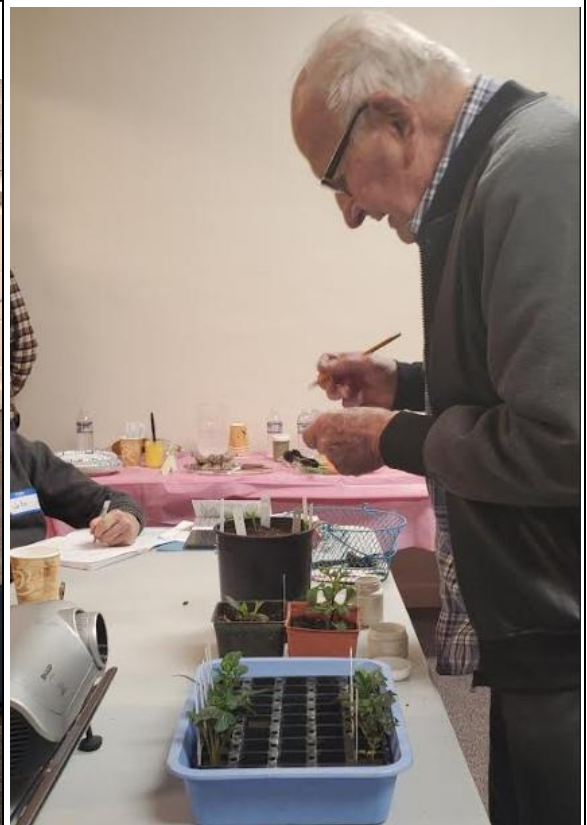
Demonstration of Propagation from tuber cuttings.