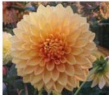
Chi Lorna Doone lr.jpg