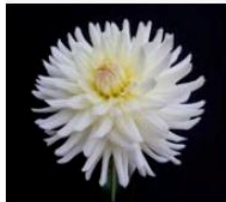
Clearview Sarah (2)-dp lr.jpg