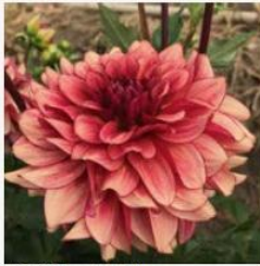
N-FORCE -ngtts lr.jpg