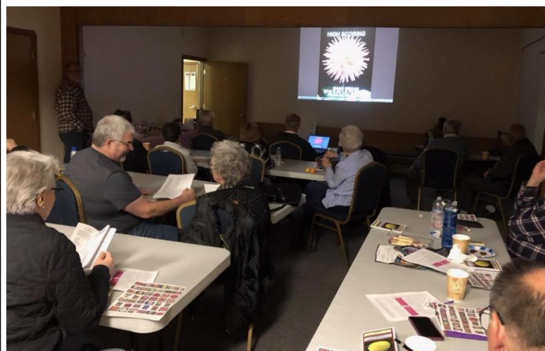
2020 New Introduction Slide Show