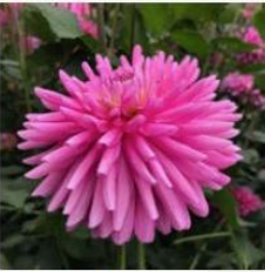
SMOOCHEs #2-ngtts lr.jpg