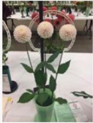
Nellie & Grace-js lr.jpg