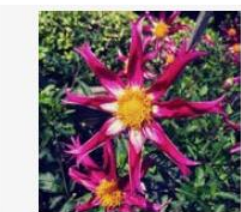
PGK Charlene-20190802_131619_Film1 lr.jpg