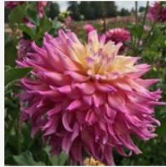
Sweet Grace-ngtts lr.jpg