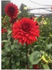
JS Henderson-js lr.jpg