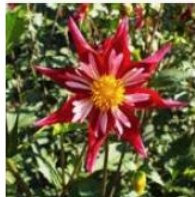
RaeAnn's Capella-wl lr.jpg