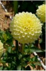
Craig Brynlee-27-mb lr.jpg