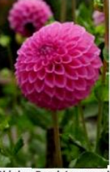
Skinlev Road Jan-narsh-lr.ima