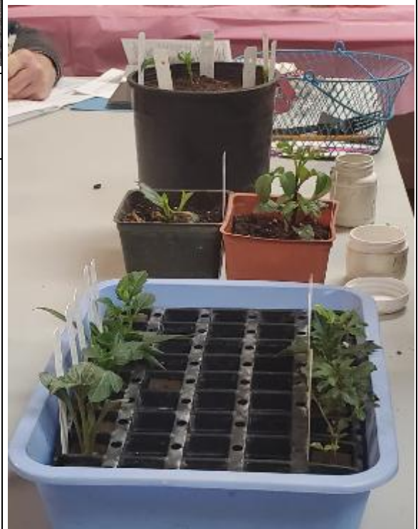
Close up of Roy Stier's cuttings, tray & oasis wedges