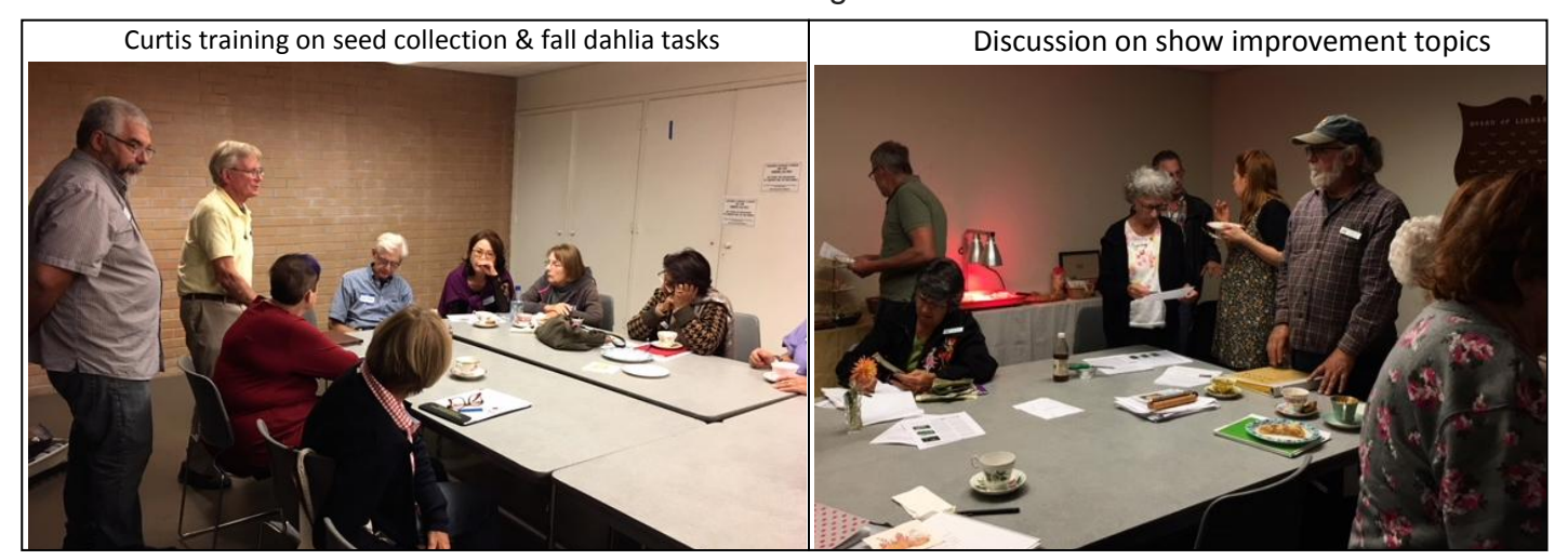
Food & Dahlias - A feast for all the senses