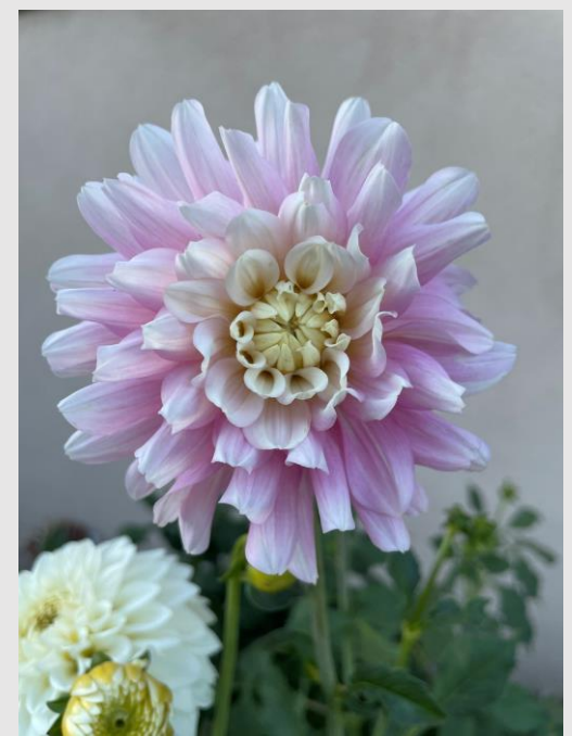
Chilson's Pride Tika Viteri