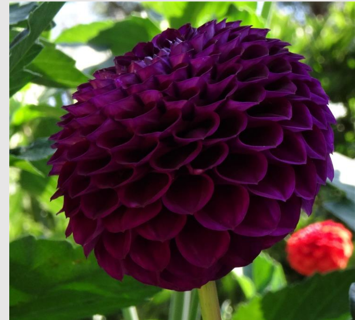
Chimicum del Blooma