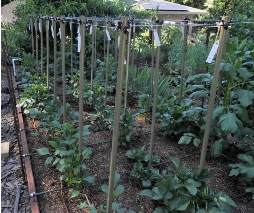
Thin, train, stake, disbud, look for pests