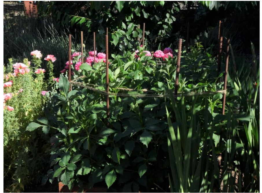
The promise of the seedlings