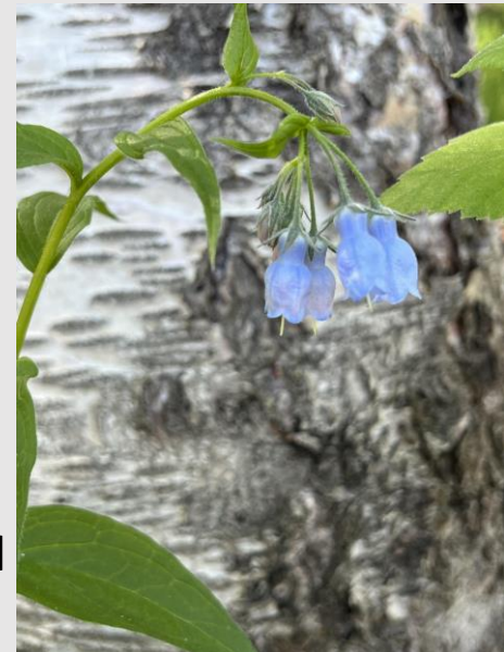
Northern Blue Bell