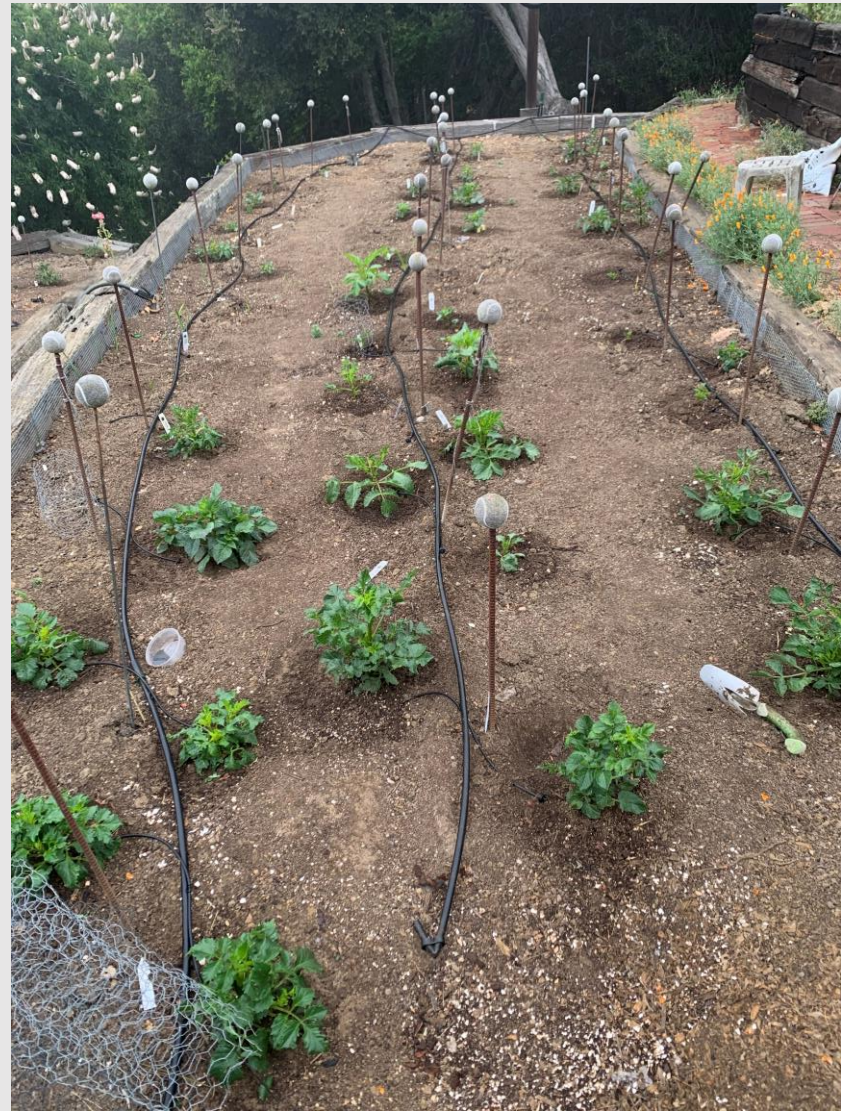
No blooms yet- but plenty potential. Beverly Dahlstadt