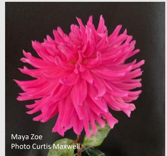
Maya Zoe

OPEN CENTER = NOT ENOUGH STOCK - SO NOT DOING IT THIS YEAR