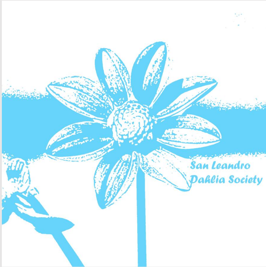
Entry #2 3 points