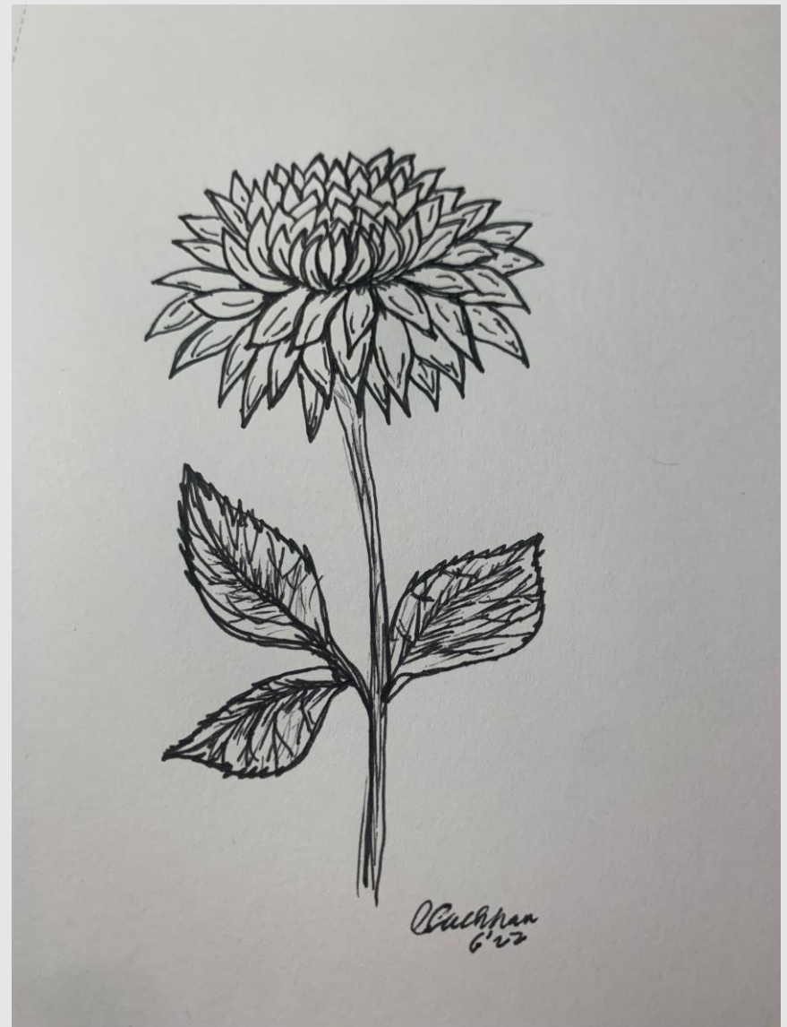
Entry #9 6 points