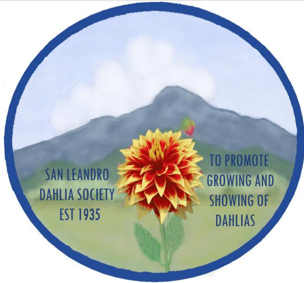
Entry #1 (accuracy of date will be vetted) 9 points