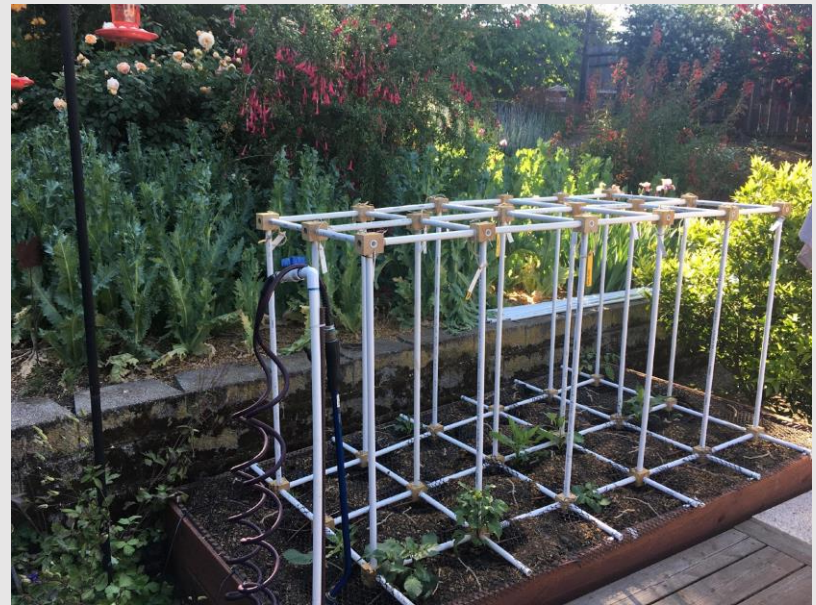
Planting out tubers and plants