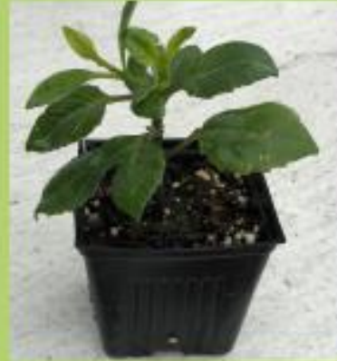
Cuttings and small plants $8 each

Sponsored by San Leandro Dahlia Society SLDS.club