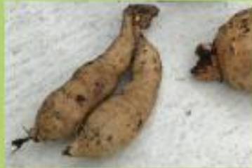
Tubers - $6 each